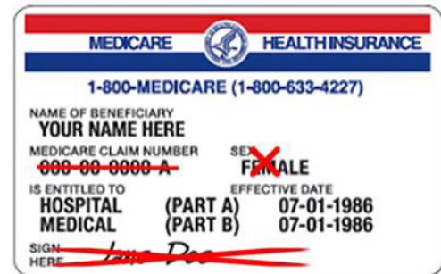
Medicare will no longer list Social Security Numbers, gender, or signatures on their cards.

For more information, please go to www.cms.gov/Medicare/New-Medicare-Card/index.html or refer to your 2018 Medicare & You Handbook .