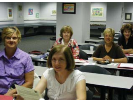
CTPF members went back to class in August to learn about pensions and the importance of advocacy efforts.

Chicago teachers and retirees went back to school this summer for an important lesson on pensions. The Chicago Teachers Union organized and hosted four member advocacy and education seminars on August