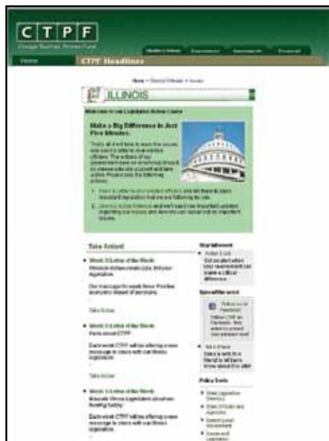
Pictured above the Legislative Action Center at www.ctpf.org . Users who register at the center are automatically enrolled in the Ambassador program.

When you visit the Legislative Action Center, you can type in your address and look up your elected representatives, send an e-mail to your legislators, and find out more about CTPF legislative efforts. If you register at the Legislative Action Center, you will automatically be enrolled in our new CTPF Pension Fund Ambassador program.