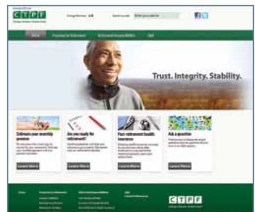
CTPF launched a new Retirement Central website in December.